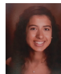
Athena S. Troop 198 Baltimore County